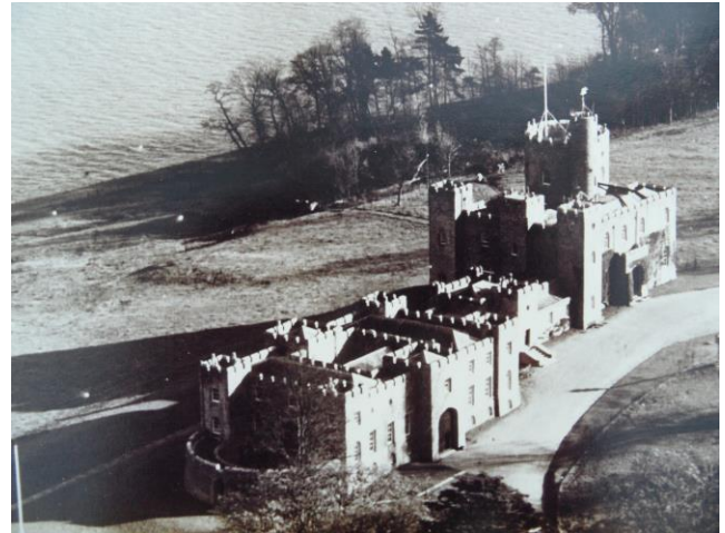
Norris Castle, built 1798 - 1808