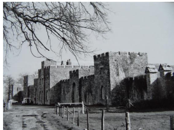
The farm and garden complex

While a number of people have owned the Norris estate, very little has changed since the early 1800s. All the owners maintained the farm in some way while enjoying the castle and its position. This is an accolade to the skill of James Wyatt. Lord Seymour used seaweed as well as farm manure to improve the soil of the estate. Prior to World War Two the walled garden had examples of every fruit that was grown in Europe. The farm building is only one of two in the whole country to receive the highest listing from Historic England and is different in that the farm and walled garden are combined in one structure.